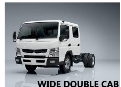
WIDE DOUBLE CAB

Wheel Type: Single piece tubeless rims Wheel Size: 17.5" Wheel Stud Pattern: TBA Tyre Size: 215/75R17.5 Spare & Tyre Carrier: Yes